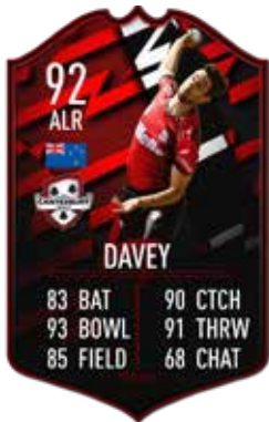
SEAN DAVEY (BROTHER-IN-LAW OF)