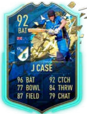
JEFF CASE (DAD)

Top Order Bat - R/A Orthodox 84 Two Dayers - 88 One Dayers HS - 124 | BB - 4/52