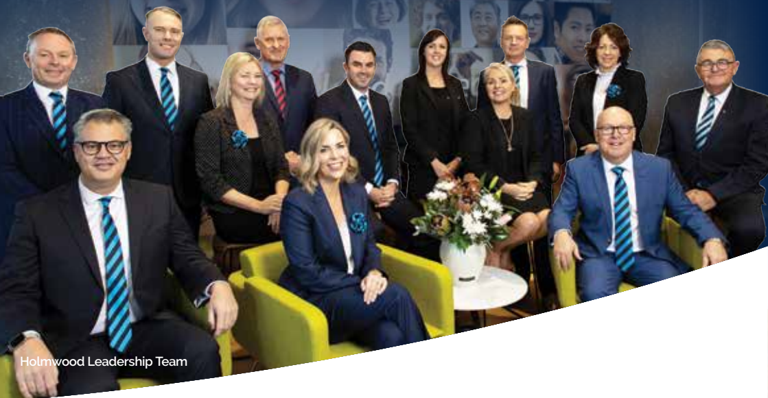
Holmwood Leadership Team

In any sport, or field of human endeavour, positive player relationships, teamwork and solid leadership are essential for success. This is where having the right team by your side is so important.